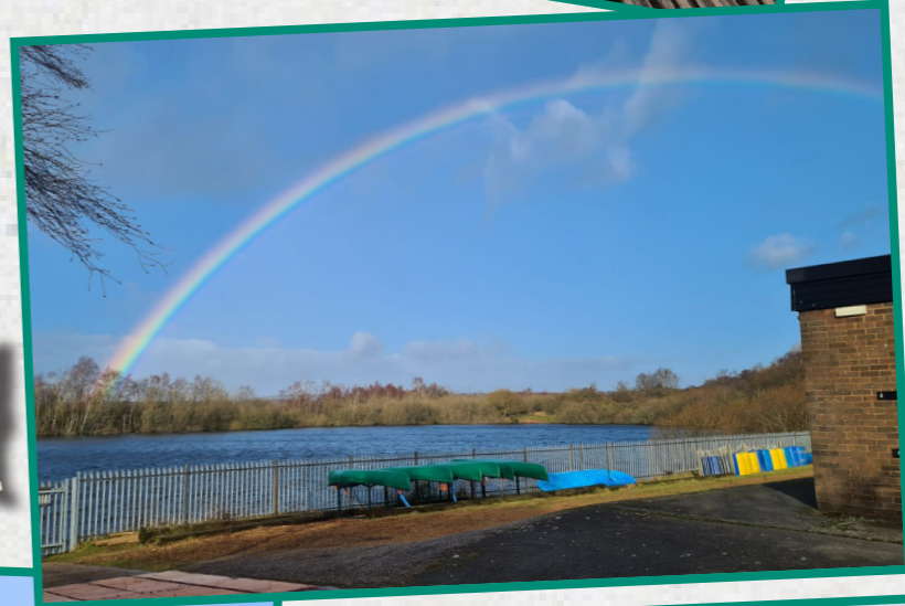
Chasewater Activity Centre